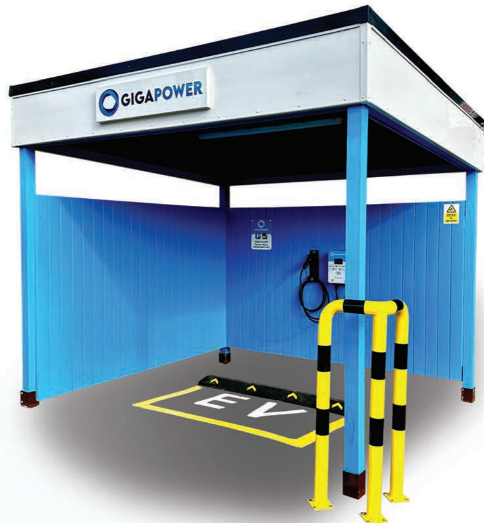
Giga Power sheltered single charger car port

Right now is the best time to offer EV charging to attract new customers, increase income and future proof your business or premises.