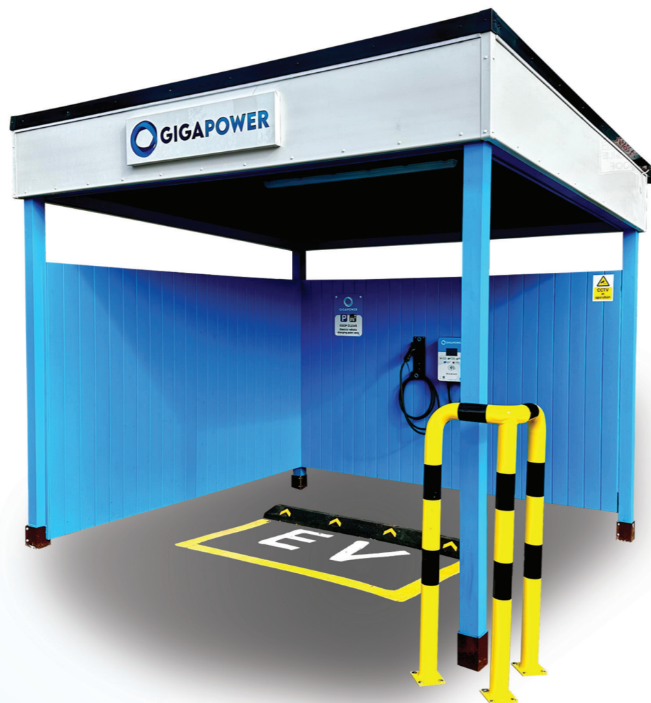
Giga Power single charger car port

Right now is the best time to offer EV charging to attract new customers, increase income and future proof your business or premises.